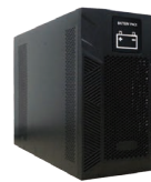
Battery cabinet (Optional)