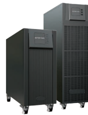
Battery cabinet (Optional)